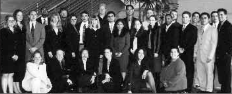
The 2000/01 Moot Court Program team members.