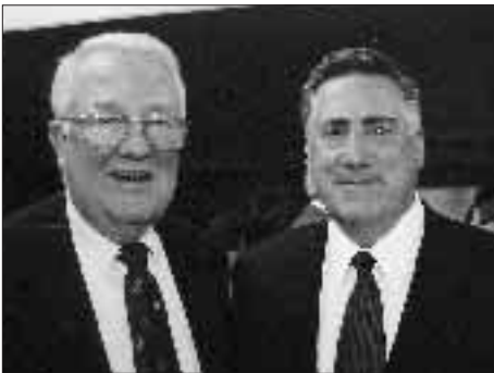
Attorney General Ed Meese with John S. Herrington ('64) at the Forum Reception.