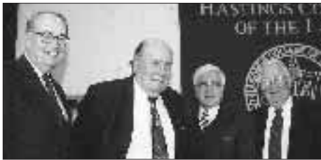
Attorneys General Dick Thornburgh and Nick Katzenbach with Forum moderator Arthur Miller and Attorney General Ed Meese.